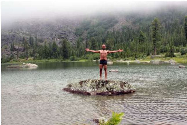
Enjoying the nature in Ergaki