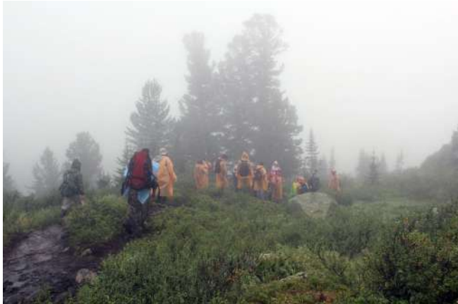
Hiking in Ergaki National Park